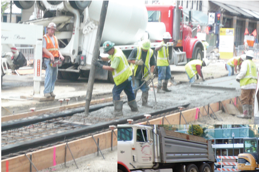
Concrete pour of track slab