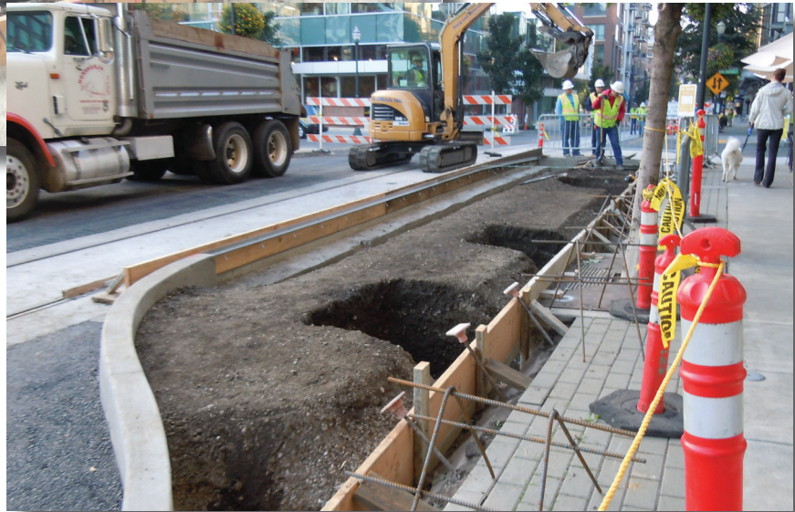
Construction of a streetcar stop (in progress)